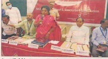
↑ புதுச்சேரியில் அரக சாரா அமைப்பு மேலாண்மை மற்றும் ஆதாரம் மேம்பாடு குறித்த கருத்தரங்கில் பேசிய துணைநிலை ஆளுநர் தமிழிசை.

புதுச்சேரியில் ரூ.50 முதல் 60 கோடி வரை கடல் மேலாண்மை திட்டம் நிறைவேற்றப்பட இருக்கிறது. அப்படி வரும்போது புதுச்சேரியில் கடல் அறிப்பு தடுக்கப்பட்டு மீனவர்கள் இன்னும் அதிக பாதுகாப்பாக இருப்பார்கள். இத்தகைய திட்டங்களை நாம் முன்னெடுத்து செல்கிறோம். மத்திய அரக நமக்கு