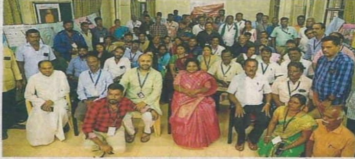
காலாப்பட்டில் நேரு யுவ கேந்திரா சார்பில் நடந்த மாநில அளவிலான கருத்தரங்கில் கவர்னர் தமிழிசை கலந்து கொண்டார்.

தொடர்ந்து, கவர்னர் தமிழிசை நிருபர்களிடம் கூறுகையில், புதுச்சேரியில் கடல்சார் உயிரினங்கள் காட்சியகம் அமைக்கவும், சுற்றுலாப் பயணிகள்