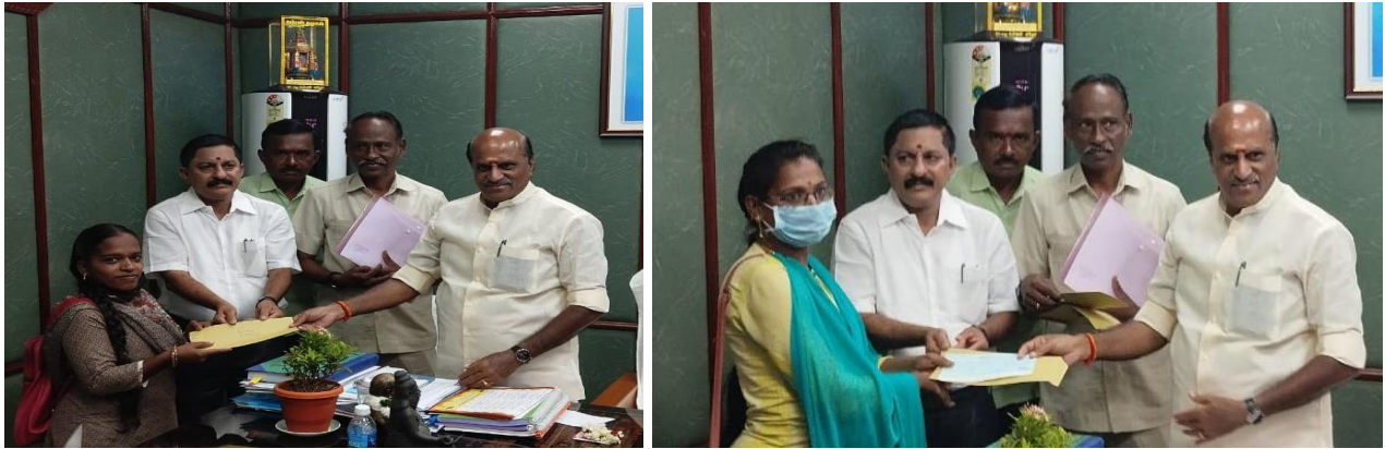
Skill Training completion certificate distribution by Hon'ble Sri.Lakshminarayanan Minister for Public Works, Government of Puducherry.

Public Work Department Minister Hon'ble Sri.Lakshminarayanan gave away cheques to Puducherry People with Disabilities to start variety of business as per their choices, we conducted General Entrepreneur training to them with the support of Indian Bank Rural Self Employment Training Institute, it was six days training program after we helped them to find their own business and supported.