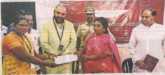
புதுச்சேரி நேரு யுவக் கேந்திரா சார்பில் காலாப்பட்டில் நடந்த அரசு சாரா அமைப்பு மேலாண்மை மாநில அளவிலான கருத்தரங்கில் பரிசீலி முடிந்த மகளிருக்கு கவர்னர் தமிழிசை சான்றிதழ் வழங்கினார்.

புதுச்சேரியில் ரூ.60 கோடியில் கடல் மேலாண்மை திட்டம் நிறைவேற்றப்பட உள்ளது. இத்திட்டம் நிறைவேற்றினால், கடல் அரிப்பு தடுக்கப்படும். இத்தகைய திட்டங்களுக்கு மத்திய